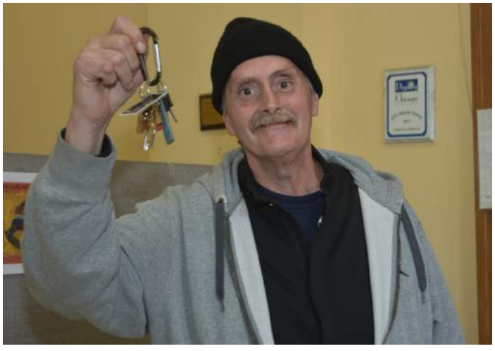
Franciscan Outreach helps guests connect to housing through CES.

CES works with housing providers that manage subsidized apartments within their own buildings or manage subsidized apartments through private landlords. Depending on the subsidy type, tenants are often expected to contribute up to 30 percent of their gross income toward monthly rent. The source of income varies depending on a person's situation. They may be employed